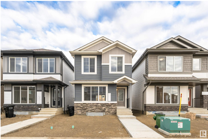
9566 Carson Bnd SW, Edmonton, AB

Main Floor Exterior Area 65.12 m 2 Interior Area 59.37 m 2