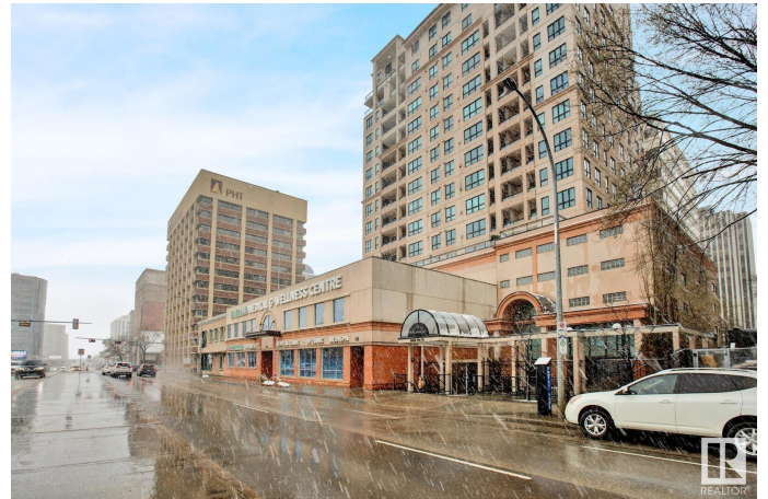
805-9939 109 St NW, Edmonton, AB